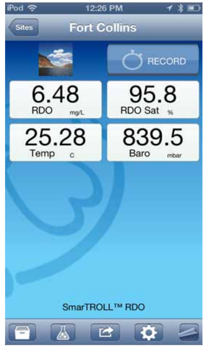
View results instantly on your smartphone.

Notes Specifications are subject to change without notice. Apple, iPhone, iPod touch, and iPad are trademarks of Apple Inc. registered in U.S. and other countries. Viton is a registered trademark of DuPont Performance Elastomers L.L.C.