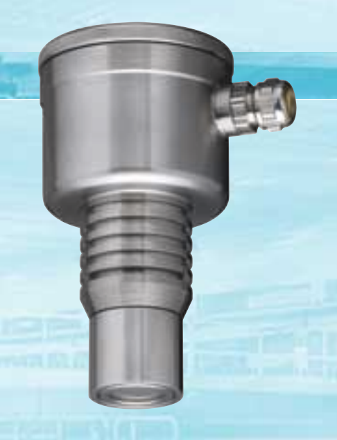
Model 8000-Range-W with diam 33 mm weld-on nipple.

Specifications can change without notice