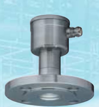
Level transmitter with special ball-valve